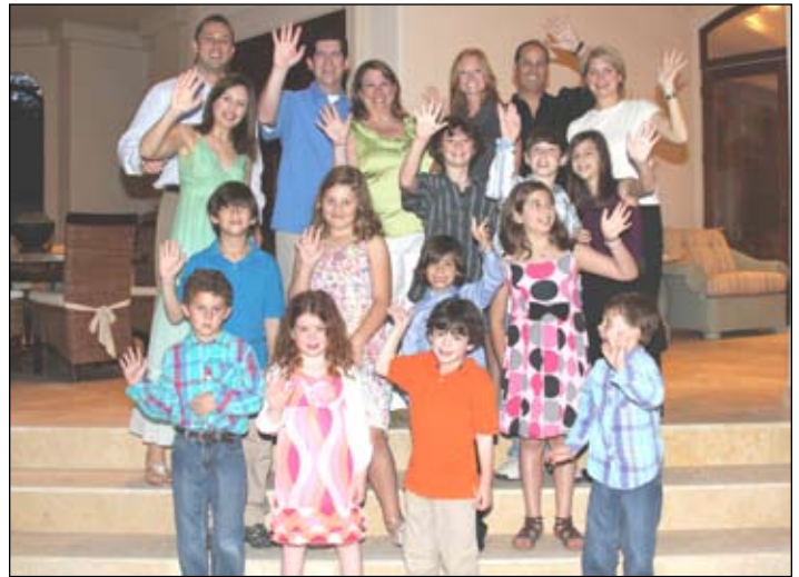
Leaders of the upcoming Beth Yeshurun Israel Family Mission and their children