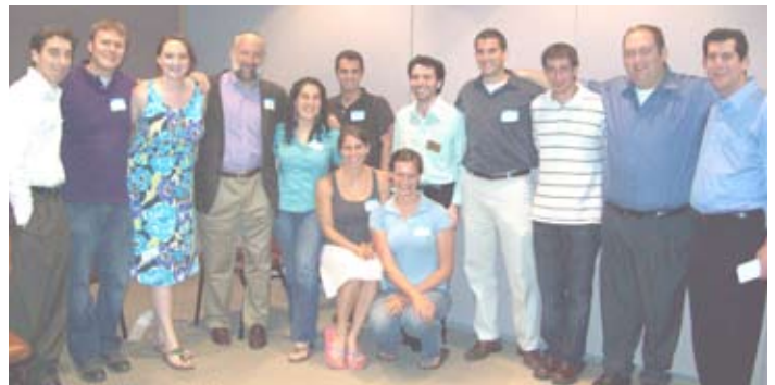
Some of the young adults that attended the meeting broke into a group to discuss ways to get young people involved in Shabbat.

"Since I moved back to Houston, I have been searching for a community that shares my interest in Jewish learning,"