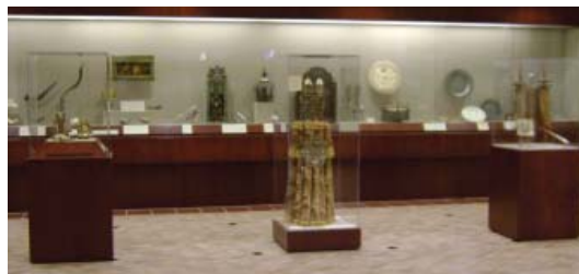
Museum central displays