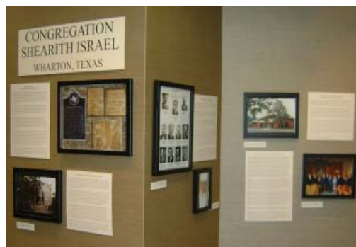
Congregation Shearith Israel in the Heritage Room

On Apr. 27, 2002, the last religious service was held at Congregation Shearith Israel in Wharton, TX. In consideration of a gift to Congregation Beth Yeshurun, the members of Shearith Israel became members