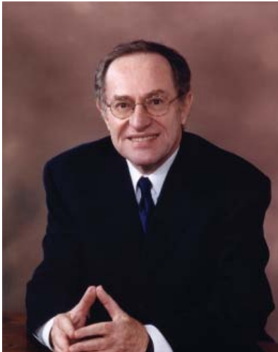
Alan Dershowitz March 9

Professor Alan M. Dershowitz has been called "the nation's most peripatetic civil liberties lawyer" and one of its "most distinguished defenders of individual rights," "the best-known criminal lawyer in the world," "the top lawyer of last resort," "America's most public Jewish defender" and "Israel's single most visible defender." The Felix Frankfurter Professor of Law at Harvard Law School, Prof. Dershowitz firmly believes that his Jewish values compel him to affirm liberal social values.