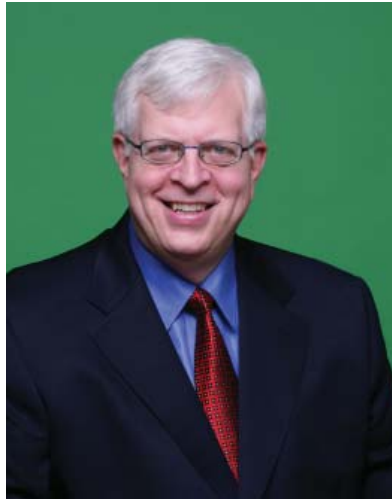
Dennis Prager March 16

Professor Alan M. Dershowitz has been called "the nation's most peripatetic civil liberties lawyer" and one of its "most distinguished defenders of individual rights," "the best-known criminal lawyer in the world," "the top lawyer of last resort," "America's most public Jewish defender" and "Israel's single most visible defender." The Felix Frankfurter Professor of Law at Harvard Law School, Prof. Dershowitz firmly believes that his Jewish values compel him to affirm liberal social values.