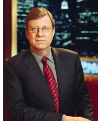
Jeff Greenfield March 23

Dennis Prager is a widely-heard and respected conservative radio talk show host, columnist, author, ethicist and public speaker. Author of numerous books on Judaism, anti-Semitism and the impact of secularism on American Jews, Prager is a public figure who does not shirk from controversy, but believes that his Jewish values compel him to speak up in support of conservative positions on major social issues facing America and the world today. He is heard locally on KNTH 1070.